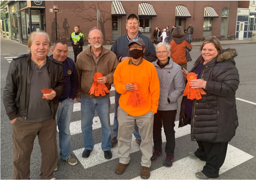
(more parade photos on next page)