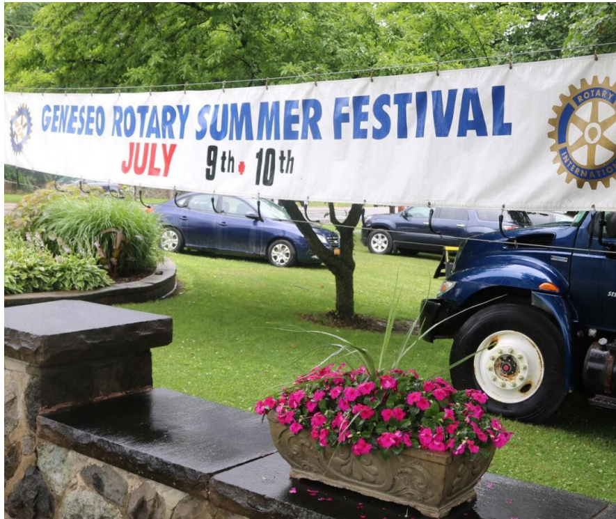
The Livingston County News July 9th photo